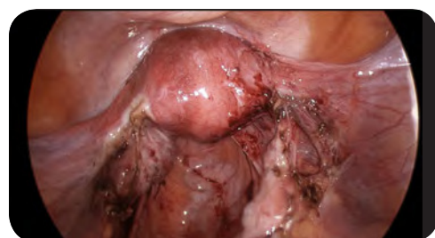
Image: Endometriosis on pelvic organs